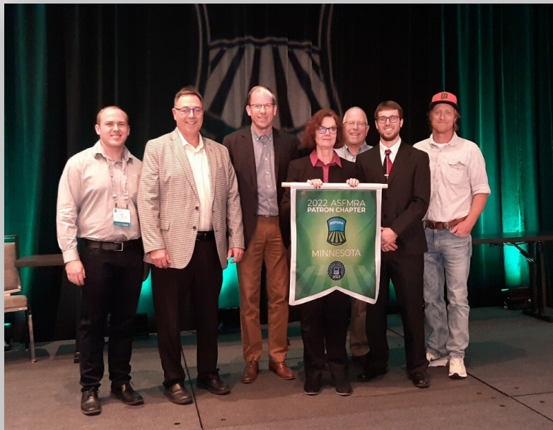
MN Attendees & 2022 Patron Chapter Award